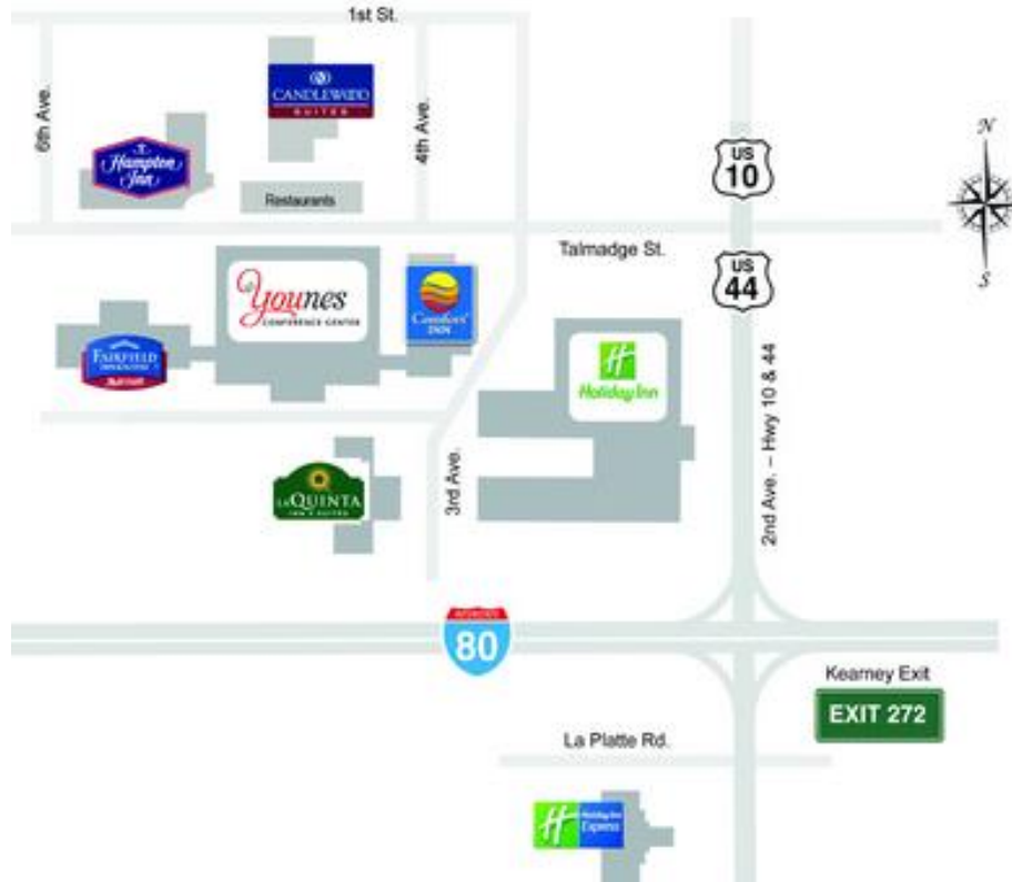
Younes Conference Center Campus Map

Secure your lodging reservations early. You are welcome to make reservations at other lodgers.